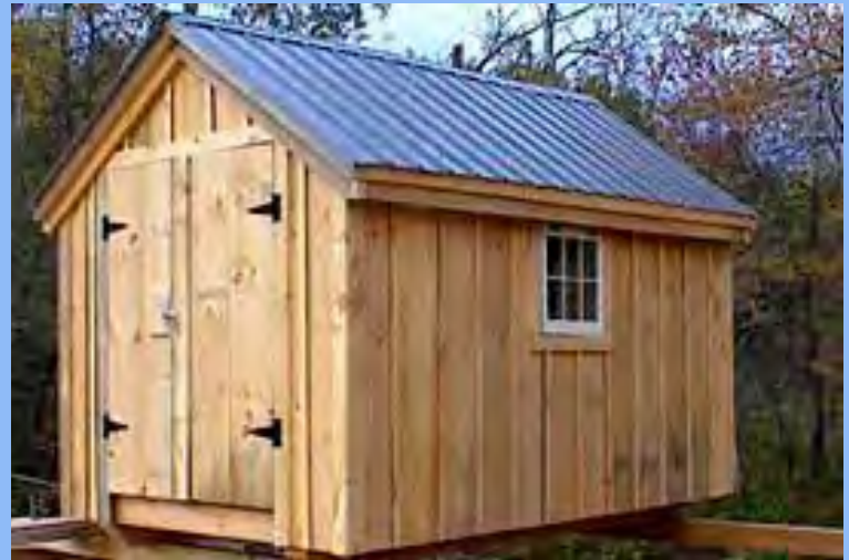
Photo may not depict standard option A, please refer to the floor plan bellow and the specifications to the left.