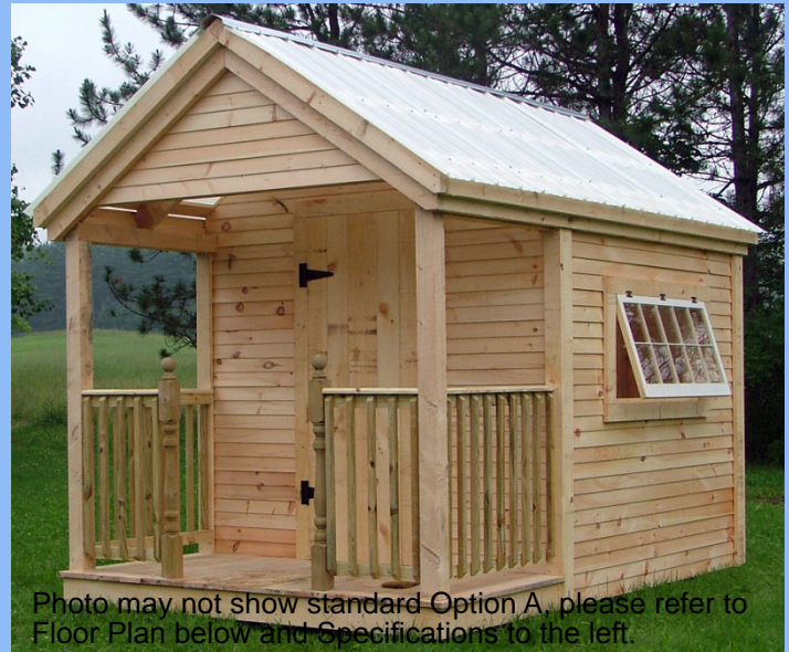
Photo may not show standard Option A, please refer to Floor Plan below and Specifications to the left.