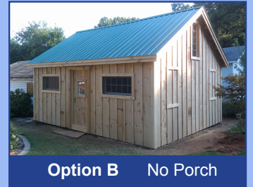
Option B No Porch