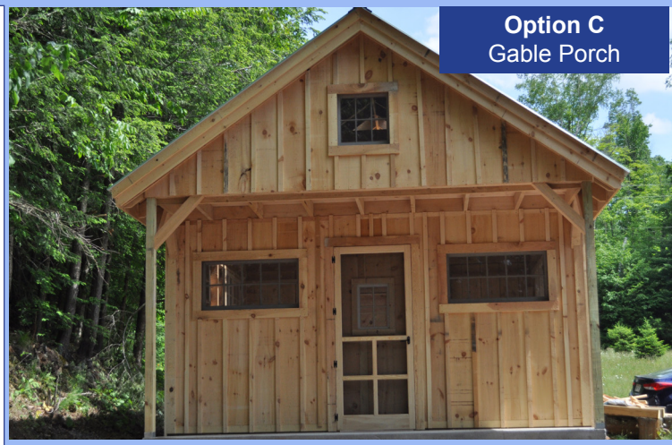
Option C Gable Porch