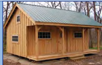
Option A Bearing Wall Porch