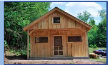
Option C Gable Porch