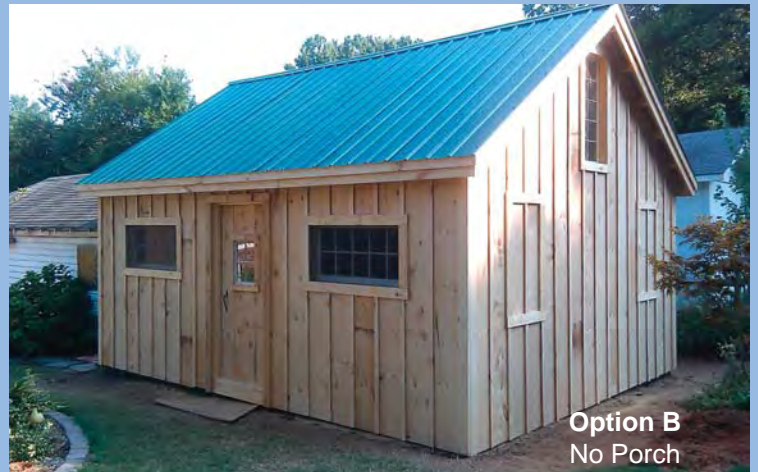
Option B No Porch

Visit www.JamaicaCottageShop.com/16x20vc.asp for more details