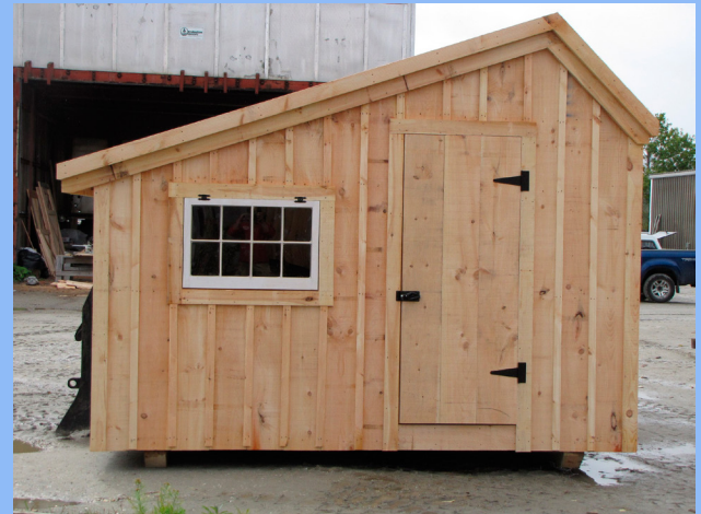
Photographs may not depict standard Option A, please see Floor Plan and Specifications to the left.