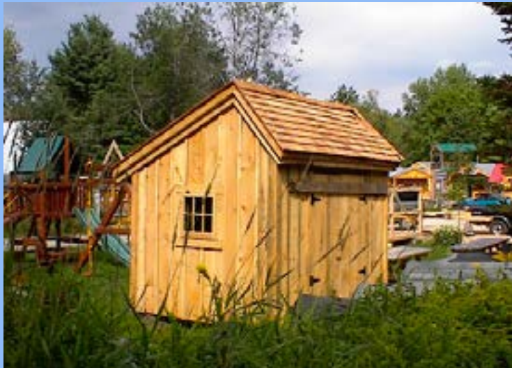
Photo may not show standard Option A, Please refer to floor plan below and specifications to the left.

Shipping Cube Size 48" W x 44" H x 121" L Kit Weight: 4350 lbs. Assembly Time: Two people, 24 hours