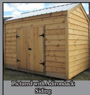
Pictured with Adirondack Siding