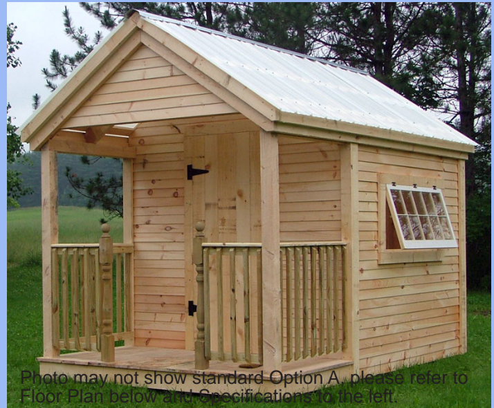
Photo may not show standard Option A, please refer to Floor Plan below and Specifications to the left.

Porch: 32 sq ft Porch with (2) 4x4 Hemlock Posts