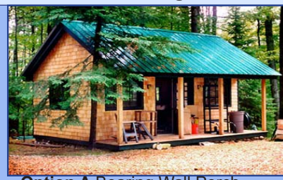
Option A Bearing Wall Porch