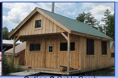
Option C Gable Porch

Plans Jamaica Cottage Shop, Inc. engineered the plans for our designs to do-it-yourself homeowners. The detailed plans include foundation options, a shopping list, and a color coded cut list. The trigonometry of the roof triangles has all been simplified with tracing the cut out roof templates. The plans are set for full dimensional lumber and provide a clear step-by-step path.