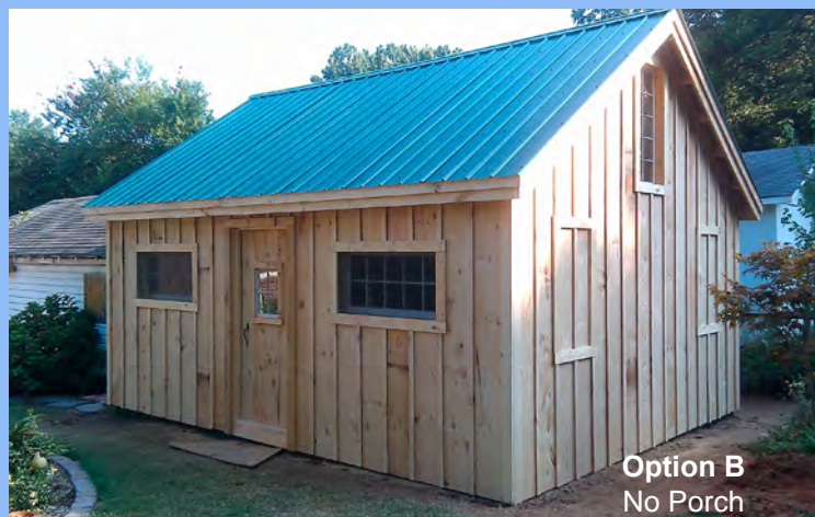
Option B No Porch

Assembly Time: Two People Forty Two Hours