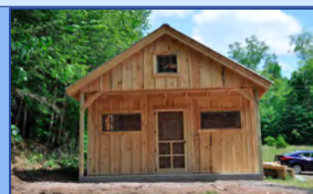
Option C Gable Porch