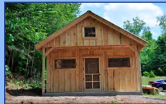
Option C Gable Porch