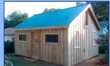
Option B No Porch