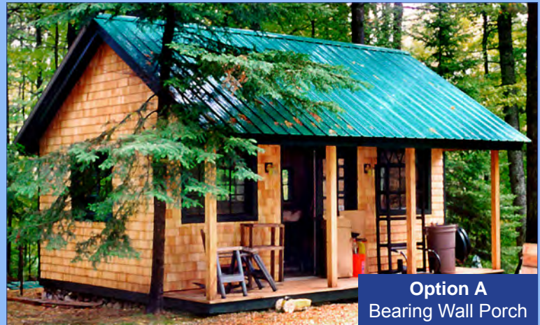
Option A Bearing Wall Porch

Visit www.JamaicaCottageShop.com/16x20vc.asp for more details