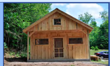
Option C Gable Porch