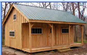
Option A Bearing Wall Porch