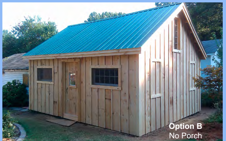
Option B No Porch

Visit www.JamaicaCottageShop.com/16x20vc.asp for more details