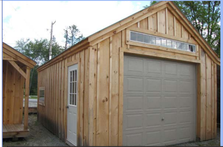
Photo may not depict standard Option A, please refer to the floor plan below and the specifications to the left.