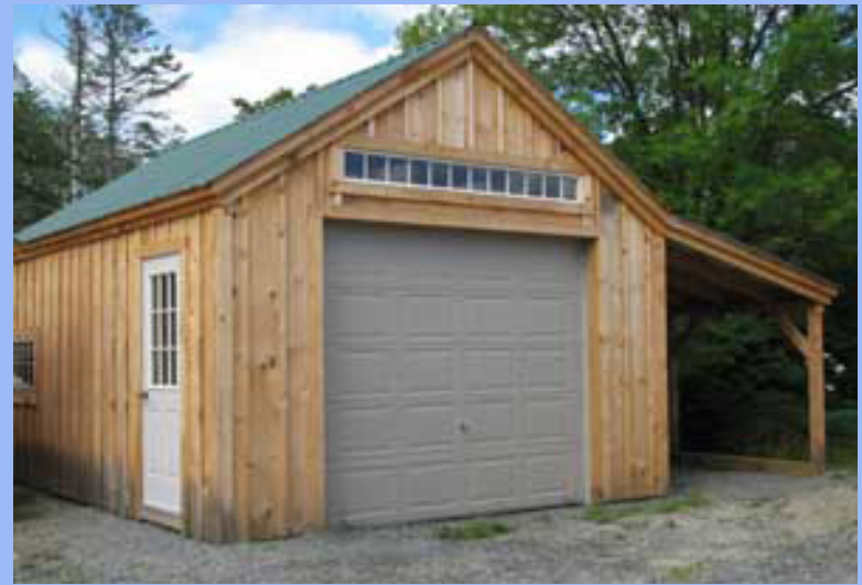
Photo may not depict standard Option A, please refer to the floor plan below and the specifications to the left.