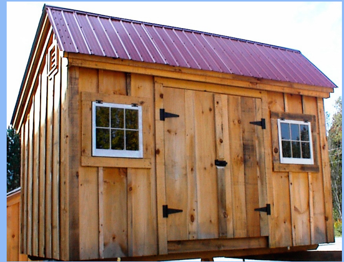
Photographs may not depict standard Option A, please see Floor Plan and Specifications to the left.