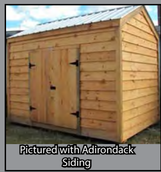
Pictured with Adirondack Siding