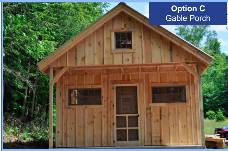
Option C Gable Porch

Assembly Time: Two People Forty Two Hours