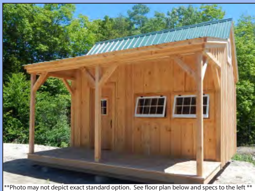
**Photo may not depict exact standard option. See floor plan below and specs to the left **

Assembly Time: approx Two People, 40 hours