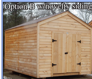
Option B w/novelty siding